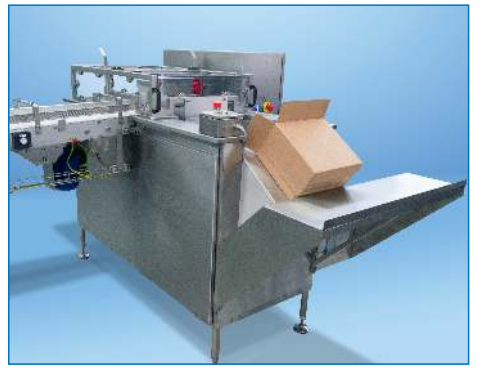
740 Series Palletising System