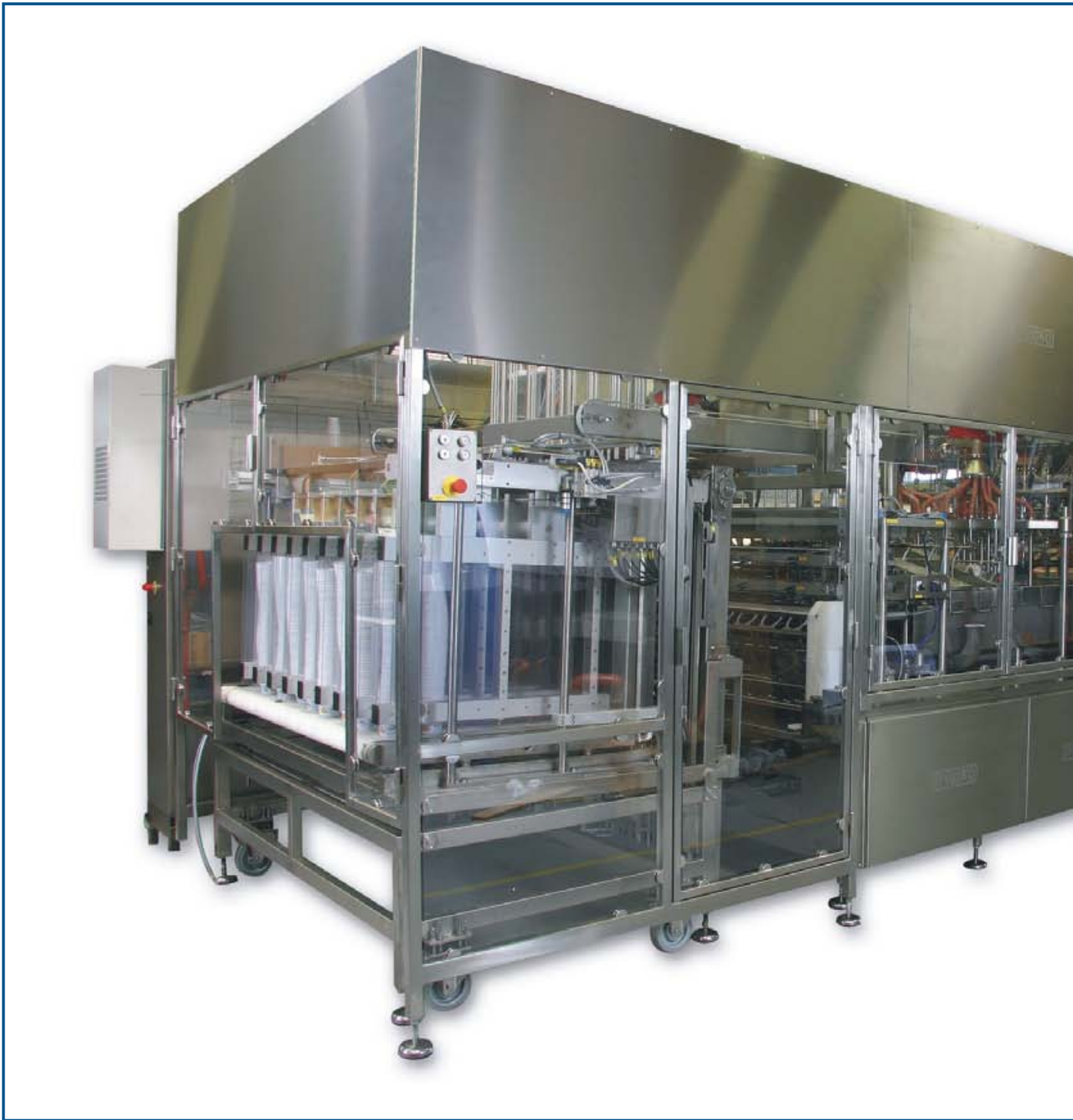
ergonomic cup stack feeding magazine