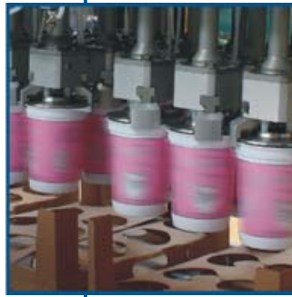
pick & place